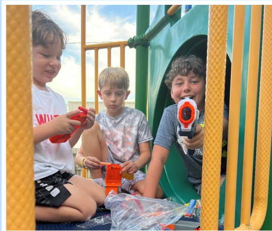
Family Night