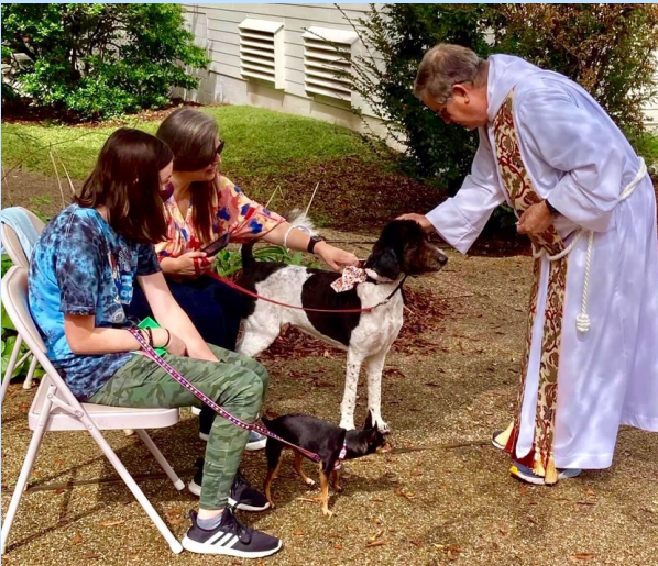
We celebrated Mass on the Grass and the Feast Day of St. Francis of Assisi on Oct. 3.